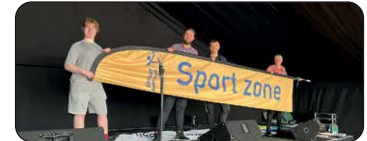
Expanse Learning volunteering during DAD Week 2023