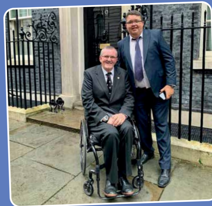
Members of Team WDP were invited to a special reception at 10 Downing Street to celebrate their achievements and to say thank you on behalf of everyone who they've helped in Warrington South.