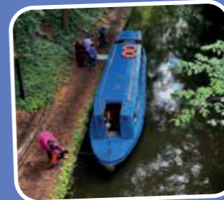
Following essential refurbishment, trips on the accessible Wizard Narrow Boat were relaunched in July 2023.