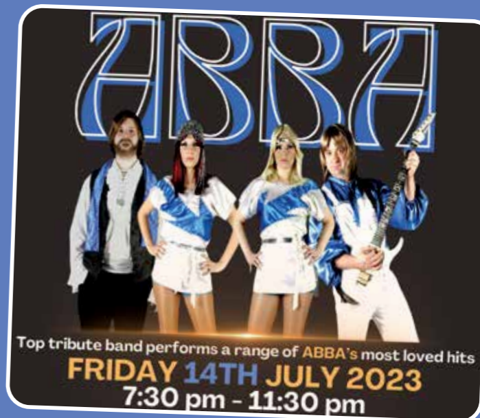
Successful 'SOLD OUT' 'Bjorn to be Abba' fundraising event as part of our DAD Week Activities, raising over £3,000.