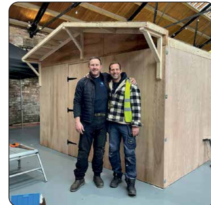
UPS Builders building Santa's Grotto