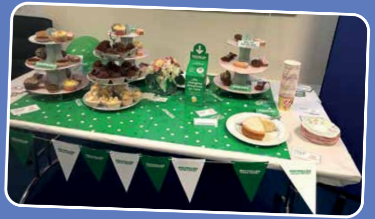
Our Young People's Lunch Club have organised a variety of events including a MacMillan Coffee Morning