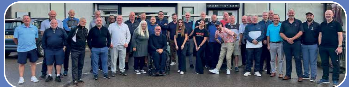
Successful Golf Day organised by the team at AKW, raising over £4,000 for WDP.