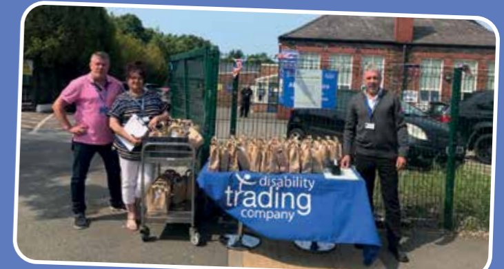
Over 800 free nutritional afterschool snack boxes were provided for local school children, as well as providing a safe and warm place for families to gain information and support during the cost of living crisis.