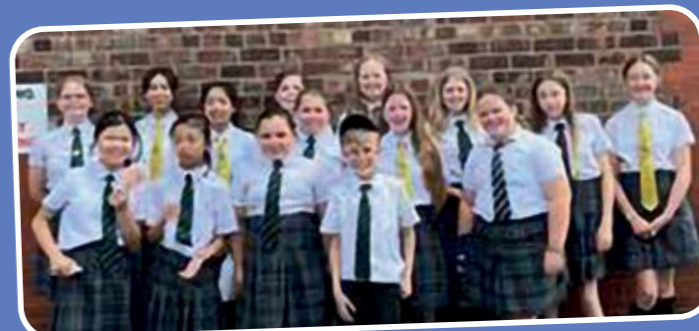
Members of Penketh High Leadership Team visited the CIL to learn about our services, speak to our Team, and take part in activities including wheelchair skills and wheelchair basketball.