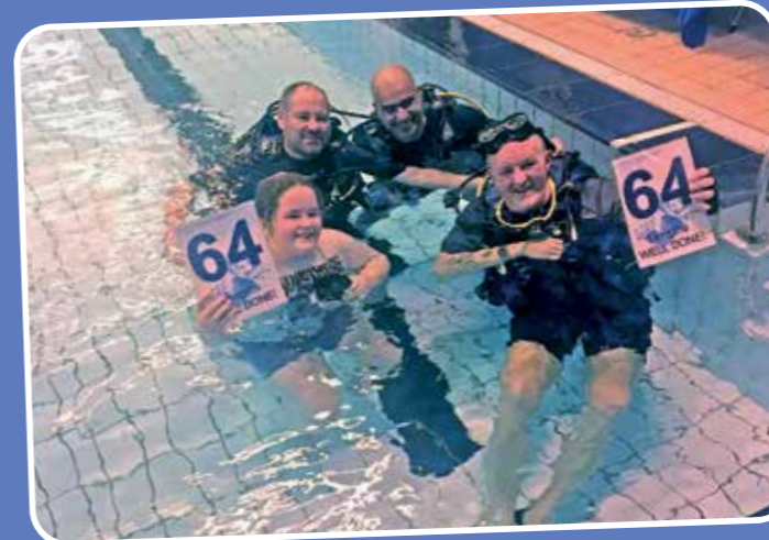
WDP Team Members and WDP Supporters took part in the annual 64 length (1 mile) Scuba Challenge. Others tried Scuba Diving for the very first time, with a Scuba Try Dive.