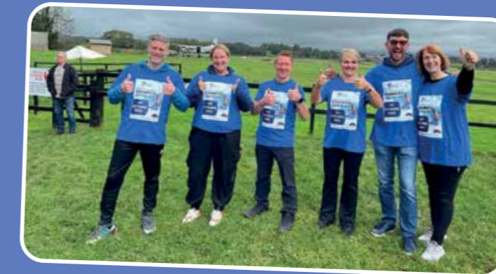
WDP Team members and supporters took part in a Skydive raising over £3000