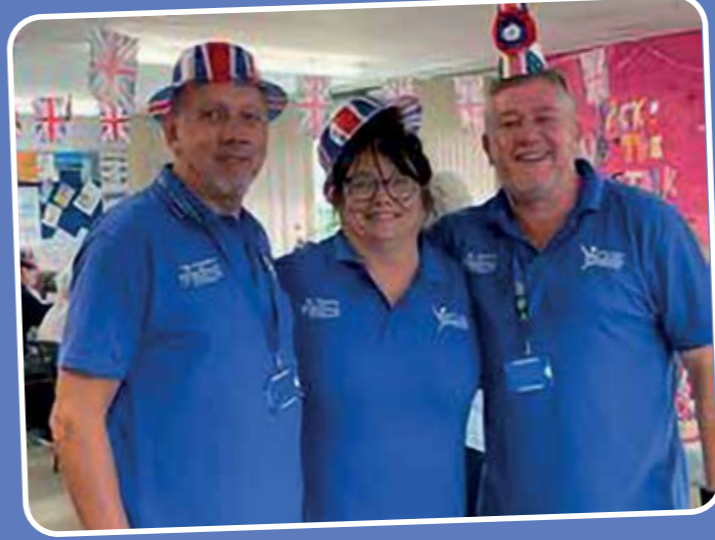
Our Kings' Coronation events included a 'Walk in the Park' and a party for Lunch Club Members