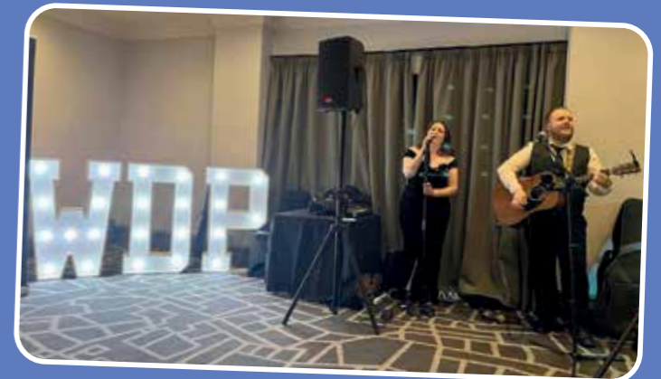
The WDP Charity Dinner held at the Village Hotel, was attended by local businesses and WDP supporters including Bright Futures Care, sponsors of the event.