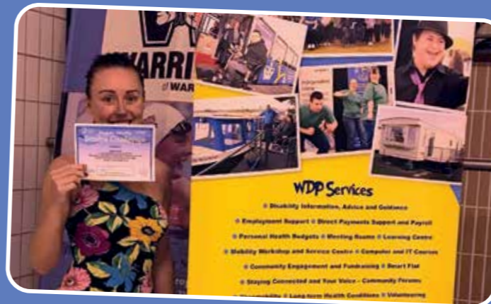
The WDP Wellbeing Working Group was launched to look at ideas on how to further support our Team.